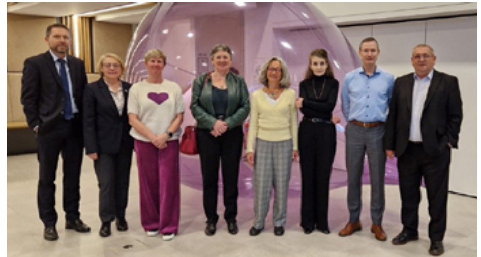
EAAB meeting in May 2023, Brussels, Belgium

The CAB and Industry Colleges urged the National Notifying Authorities, which have the final exclusive responsibility for notification at the national level, to participate in solving any issues together with the European Commission to ensure further the validity acceptance of certificates issued by notified bodies.