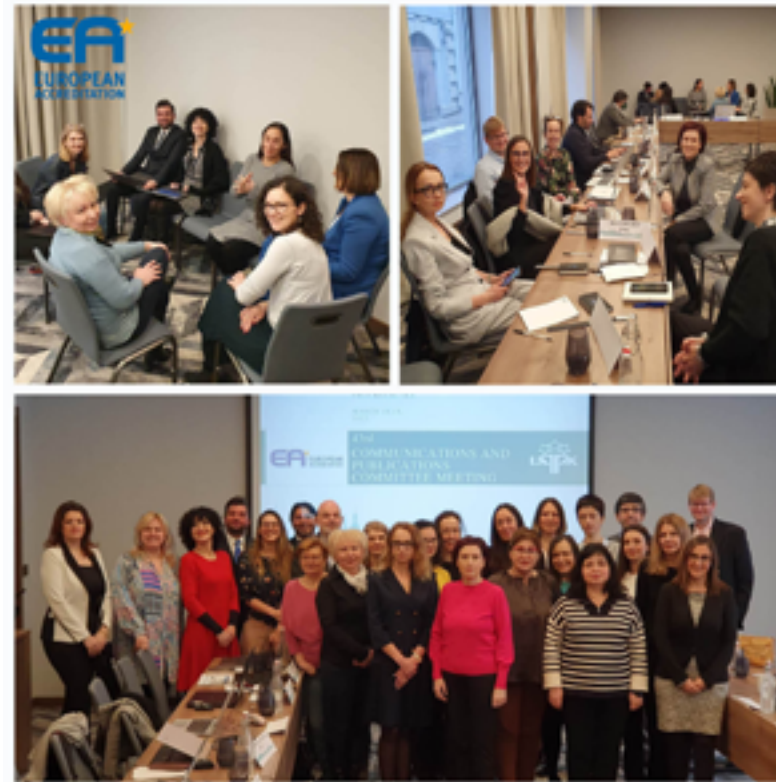
Last CPC meeting in March 2023, Riga, Latvia