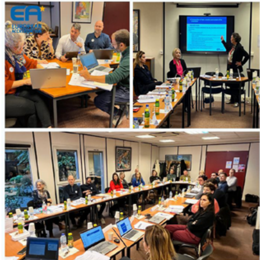
Newcomer training session on 12-14 December 2023, Paris, France

A Train-the-trainer course on ISO 15189:2022 Medical laboratories — Requirements for quality and competence was held between 6-7 June 2023 (1 st session) and 8-9 June 2023 (2 nd session). The training intended to cover on the relevant changes of the new standard ISO 15189:2022 where particular focus is needed.